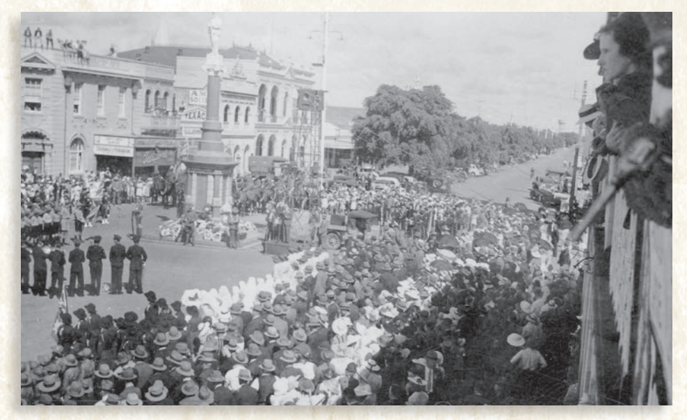
Dedication ceremony for Fallen Soldiers Monument Bourbong Street Bundaberg, 1921.

A free morning tea is provided at the conclusion of the Service.