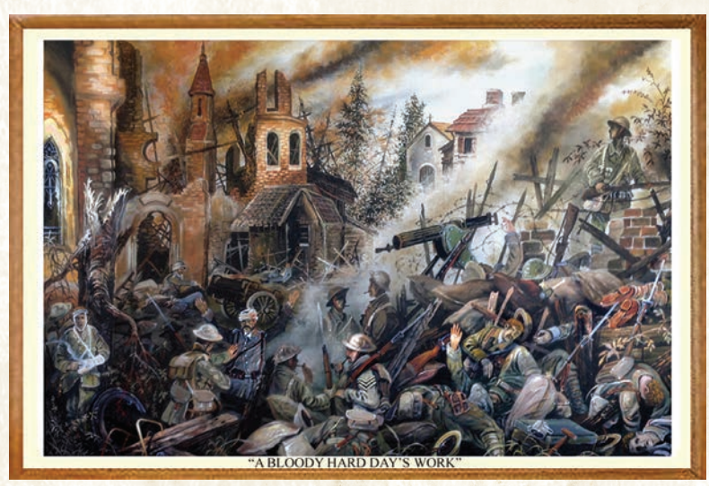
Battle of Villers-Bretonneux by Gary Woodfield